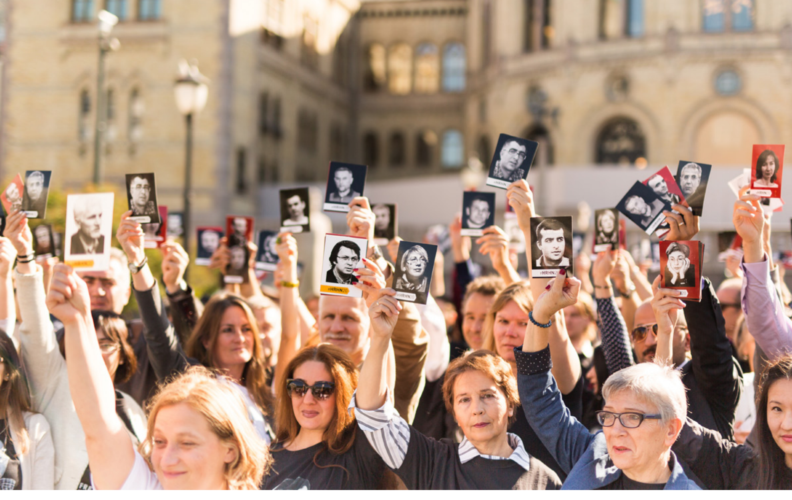
Photo: Human rights defenders from around the network of Human Rights Houses gathered in Oslo.

national law if needed. It includes work on all human rights, and choice of method, whether it is advocating for human rights through peaceful protests or social media, establishing human rights organisations, working on legal cases, or any other non-violent means. This right requires the enjoyment of many other rights, principally the fundamental rights to expression, association, and assembly, but also to many others, as outlined and explored further in the standards set out in this booklet.